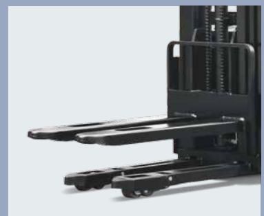
Tandem load wheel