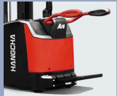
The integrated stamping molded guardrail offers better protection for the operator