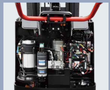
Back cover can be opened fully, and all components and parts are clear at a glance, which is very convenient for maintenance of the entire machine